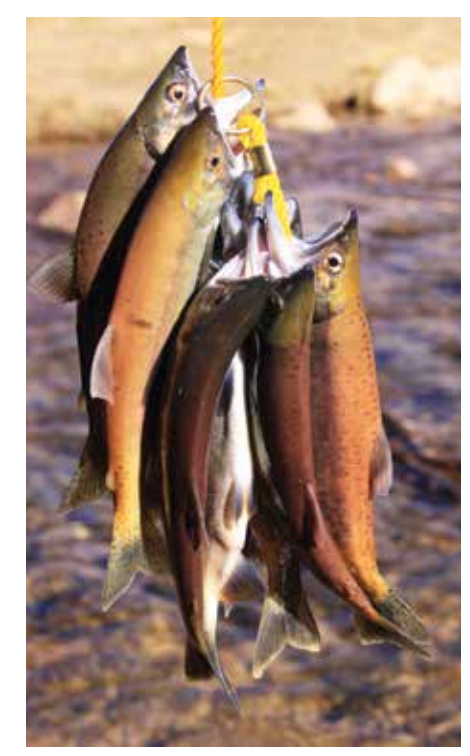
Dave Gibson Nederland

Though the golden aspen leaves may have fallen weeks ago, colors in the mountains aren't done changing just yet. Transformed from silver to red with morphing males sporting hooked jaws and olive-colored heads, kokanee salmon in Barker Reservoir, Nederland, Colorado, have returned to the area where they were originally released by the upper spillway.