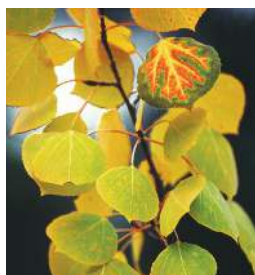
Peak Perspectives page 4