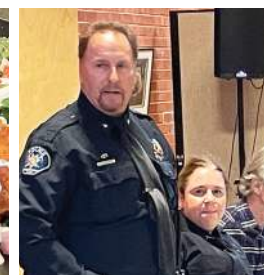
Government page 24 to 31

Police & Fire - page 2, 12, 14, 15 Music - page 3 Peak Perspectives - page 4 Featured Event - page 5 Movie of the Week - page 5