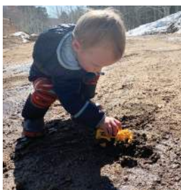
Parenting page 19