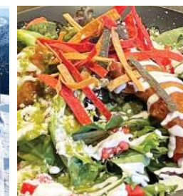
Keep it Local page 8 to 11