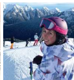
School Zone page 16 to 23