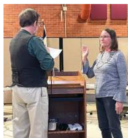
New BOT sworn in page 24, 25, 30, 31