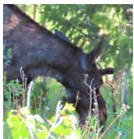
Living with Wildlife page 2, 7