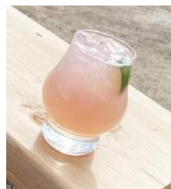
Keep it Local page 10, 11