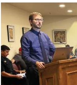
Government page 26 to 29, 32