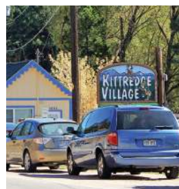
Discover Colorado page 22