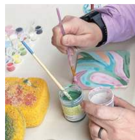
Event of the Peaks page 4, 5, 7, 19