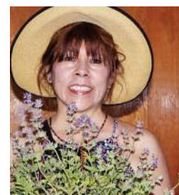
CSU Plant Sale page 12