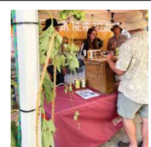
Central City Beer Fest page 26, 27