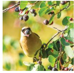
Nature see page 20

Music & Art - page 2, 3 Peak Perspectives - page 4, 5 Movie of the Week - page 5 Puzzles - page 6