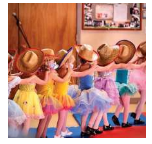
Keep it Local page 10, 11