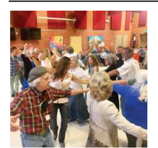
Community Events see page 8