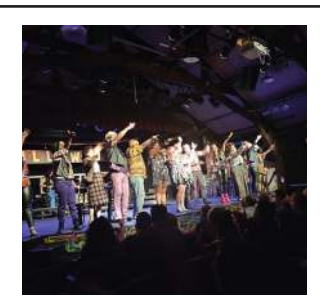
Discover Colorado page 18