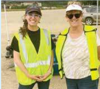
Paint drop off wraps up see page 13