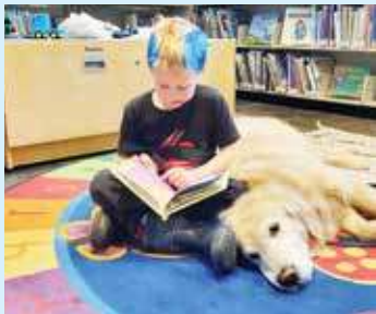
Dog Days of Summer see page 16, 17, 32