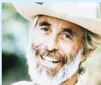
Obituary see page 19