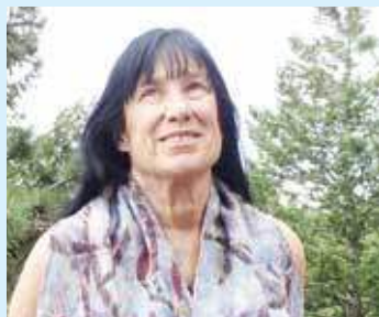
Studio Tour & Local Art see page 8, 9, 14, 15