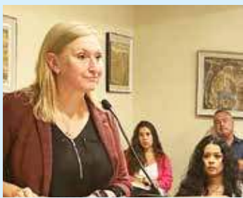
Government see page 27 to 35