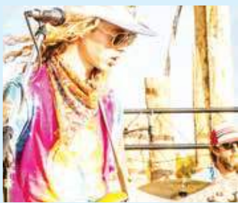
Music of the Mountains see page 2, 3, 10