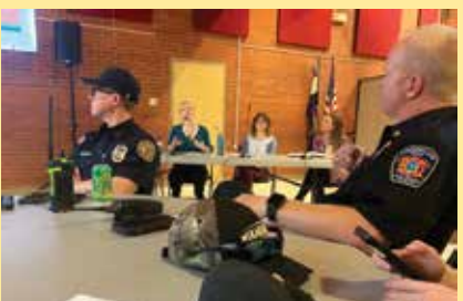
Police & Fire see page 17, 20, 21, 31