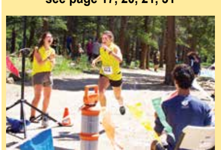
Fiat Fest; 5K, food trucks and more see page 14,15