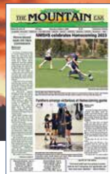
Strength in towns.