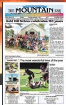
Together we build.