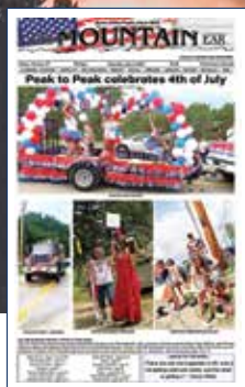
We touch hearts.