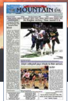
And mountain love.

It's all for you. Community is at the center of our business. And to celebrate our commitment of bringing relevant news and local happenings to your living room every week, we are offering incredible savings on a yearly subscription to The Mountain-Ear, your favorite read. Time to treat yourself, or a friend, to a year of news at altitude!