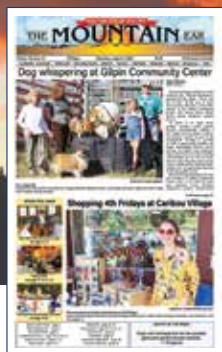
Community is core.